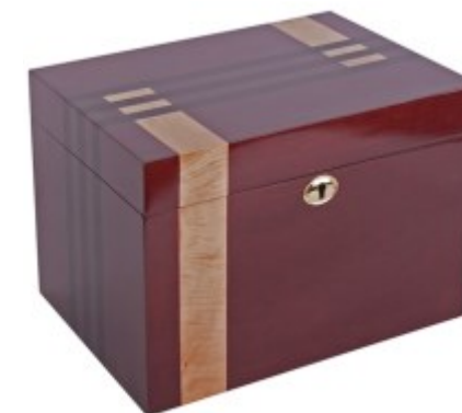
with Inlaid Wooden "Azure" Casket £255:00