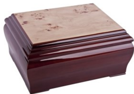
with Continental Casket £235:00