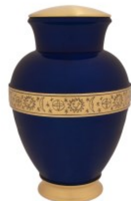
with Blue Harvest, Metal Urn £335:00