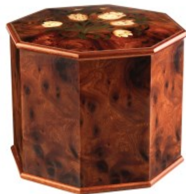
with Florence Urn £585:00