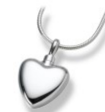
with Love Heart (no chain) £295:00

Our Prices Include for the Collection/Receiving of the Ashes, for taking responsibility for them and for storage on our premises for up to thirty days Subject to availability