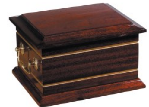
with Solid Wood "Lesbury" Urn £275:00

Our Prices Include for the Collection/Receiving of the Ashes, for taking responsibility for them and for storage on our premises for up to thirty days Subject to availability