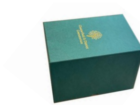
with Crematorium Box £60