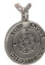
with Compass (with chain) £180:00