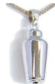
with Mini Urn Pendant (no chain) £265:00