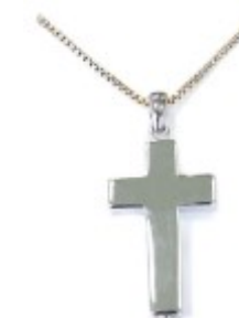
with Cross (with chain) £265:00