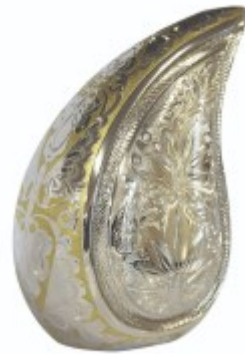
with Teardrop Patterned Urn £375:00 Inc. Keepsake - £455.00