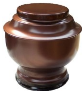
with Metal Spun Urn £175:00