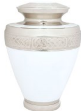
with Brass "Marble White" Urn £275:00