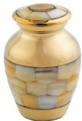
with Mosaic Urn £285:00