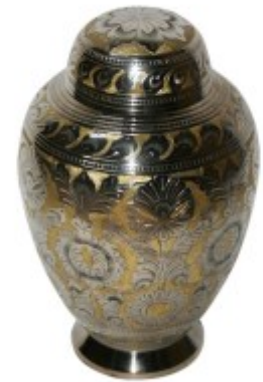
with Ambassador Urn £285:00