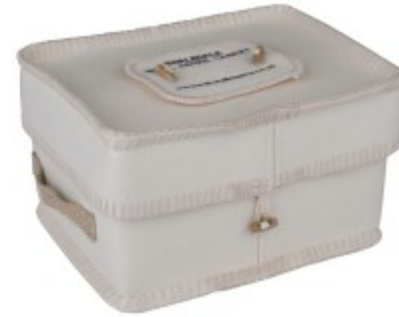
with White Woollen Urn £225:00