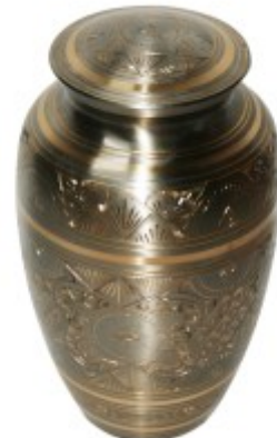
with "Sovereign" urn £270:00