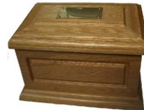
with Solid Oak Casket £215:00