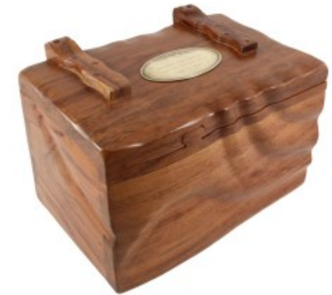
with Solid Wood "Trent" Urn £295:00