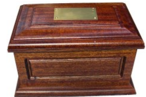
with Solid Mahogany Casket £215:00