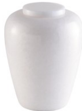
with "Simply Marble" Urn £275:00