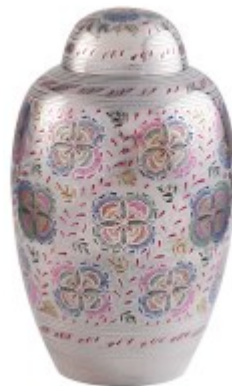
with "Grace" Urn £275:00